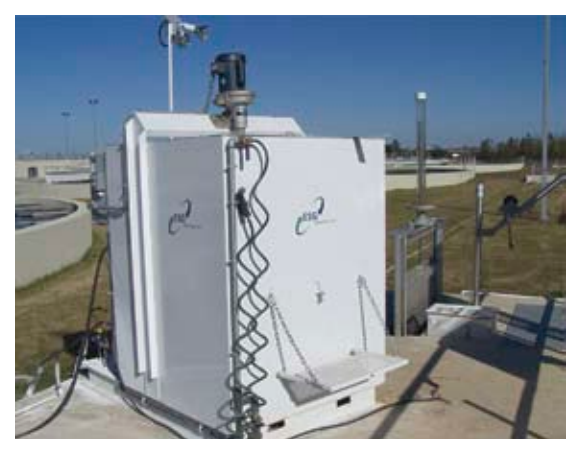
New Polymer and Lime Pumping System