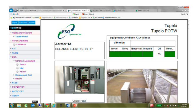
SCREENSHOT I-ESG/PSD Condition Assessment