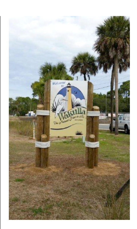
Team Wakulla Road and Bridge crews have been busy installing new "Welcome to Wakulla County" signs at the main entrances to the County. The new signage looks great!