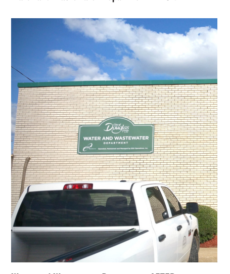
Water and Wastewater Department AFTER

in Douglas. If contracted out this project could conceivably cost the City over $20,000. Team Douglas also cleaned and painted Well #7 and is in the process of raising and rehabilitating several manholes around the City. A huge word of thanks to all ESG associates who helped welcome Team Douglas and worked to ensure a smooth transition.