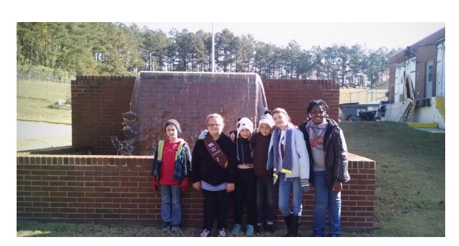
Local Girl Scout Troup Tours Water Treatment Plant