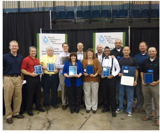
ESG/Lockheed Martin Awarded Lab of the Year by the GAWP

ESG was subject to an annual Supplier Review by Lockheed Martin representatives in Marietta and Fort Worth, Texas. This gave us the opportunity to present our accomplishments to date as well as share our goals for the future. The client expressed appreciation and is very pleased with ESG's performance.