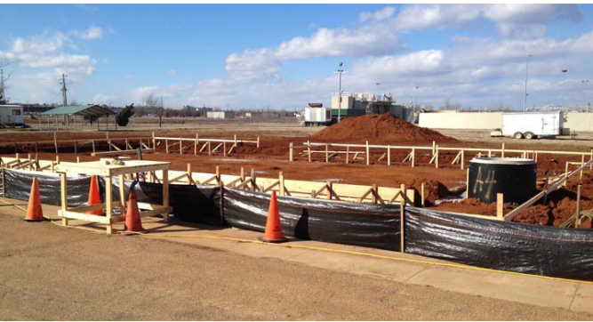
Construction of the phosphorus removal building begin in November.