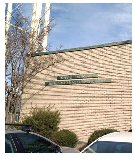
Water and Wastewater Department BEFORE