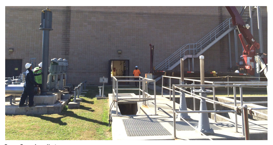
Reuse Pump Installation