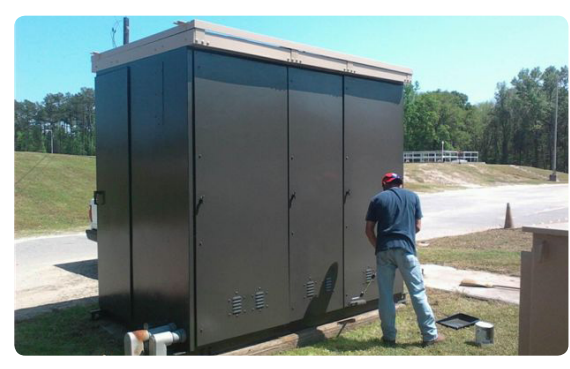
Operations personnel began "spring" cleaning throughout the WWTP. Earl Shouse (WW Operator) is shown painting the control room to match the new colors of the Operations Building.