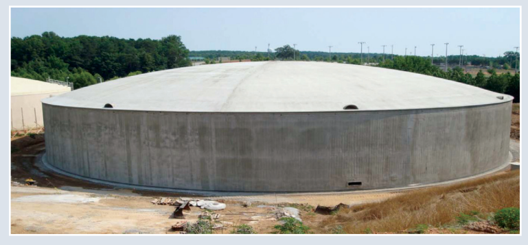
The New 8 Million Gallon Clearwell

Construction on the Water Plant expansion has been progressing at a steady pace. Pictured above is the new Membrane filtration building where state-of-the-art technology will be employed to increase treatment capacity an additional 12 million gallons per day. In addition to increased treatment capacity, finished water storage will be increased to a total of 13 million gallons with the new 8 million gallon clearwell (pictured below). The new plant expansion will be a welcomed asset to help meet the present and future needs of the citizens of Forsyth County.