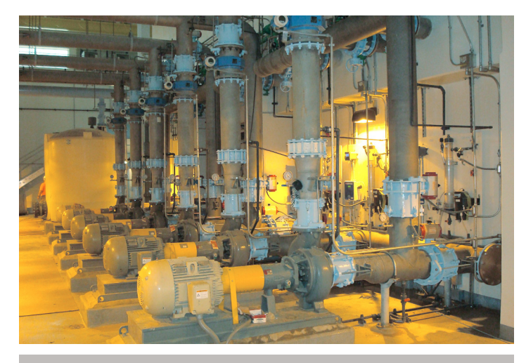
Membrane Building Pump Room