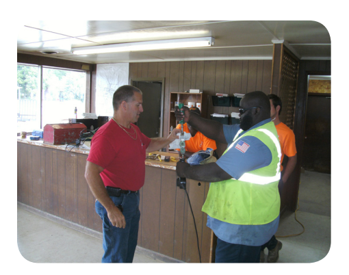
Natural Gas Training