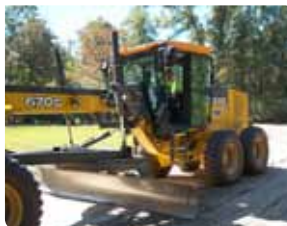
New John Deere Grader